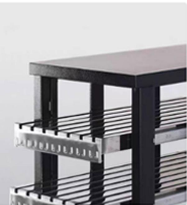
The slot of the cabinet used for storing tools