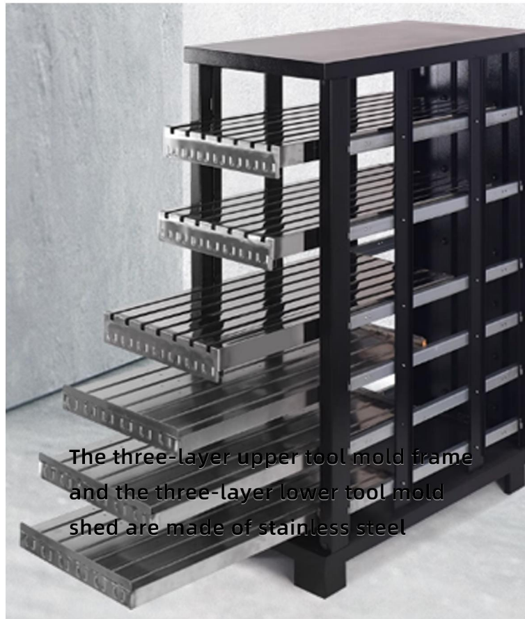
The three-layer upper tool mold frame and the three-layer lower tool mold shed are made of stainless steel